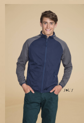
ROLLINGS MEN 01624