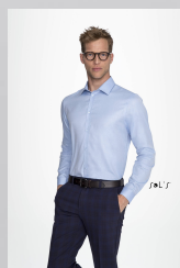
BRODY MEN 02102